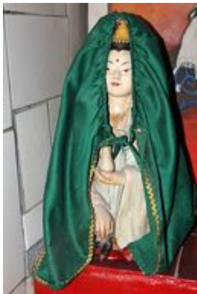
Figure 9 The Mazu-Guanyin Jailangkung of Kwan Seng Beon. Note the pencil under the hand.

grandfather had set up the original shrine in 1970. The old man also used two jailangkungs . Sugiharto's father inherited the spirit baskets and the temple in 1986. In 1996, a fire at the temple destroyed both original jailangkungs . Similar-looking substitutes were made. Sugiharto inherited the temple practice in 1999, including the replacement jailangkungs , beautiful paper-mâché sculptures built over basket armatures (Figure 9).