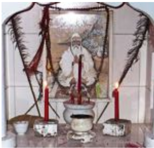
Figure 3 Portrait of Datok Pak Gani.

Datok Pak Gani séances take place in a small wood-and-brick temple in Kampong Natuna. There is a portrait of the saint in an outdoor shrine in front of the temple. The separate accommodation is because Pak Gani is a Muslim spirit, whereas the temple is Daoist. His picture shows Pak Gani as a distinguished old man dressed in white, wearing the skull cap of a returnee from the pilgrimage to Mecca (Figure 3).