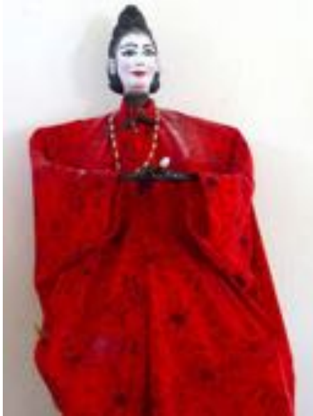
Figure 7 Bei Gu Jailangkung at Kebumen; a basket armature is under the gown.