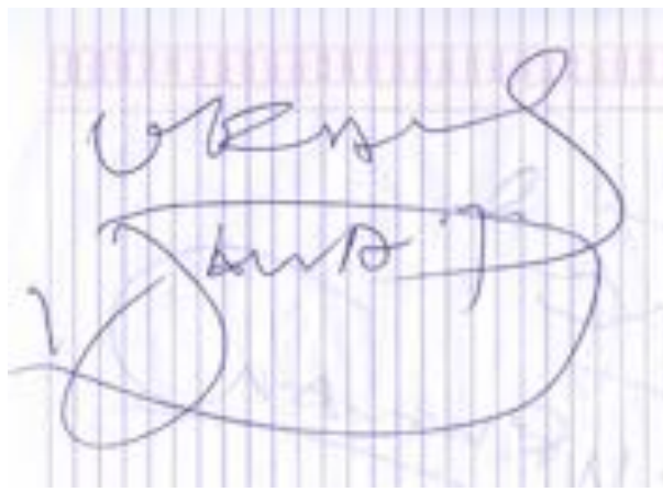
Figure 6 Pak Gani describes himself as “Orang Jawa,” a Javanese.