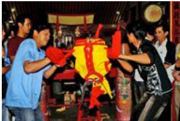
Figure 1 The beast of Singkawang, a jailangkung basket wearing a shirt.

uals and Malay magic, a spirit-possessed basket, endearingly dressed in a little shirt, was a discovery. I pressed my informants for answers, only to be met with nonchalance. Apparently, jailangkung is commonplace in Indonesia.